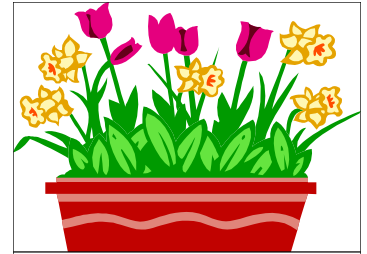
April Showers Bring May Flowers!

The fastest-growing kind of trash in the world is toxic, non-recyclable, batteries. Use rechargeable batteries. You will save money AND help the environment.